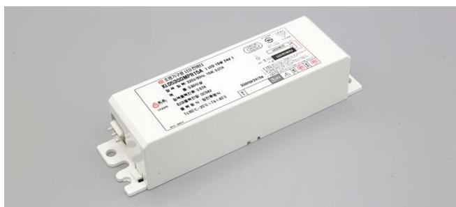
Dimension [ mm ]